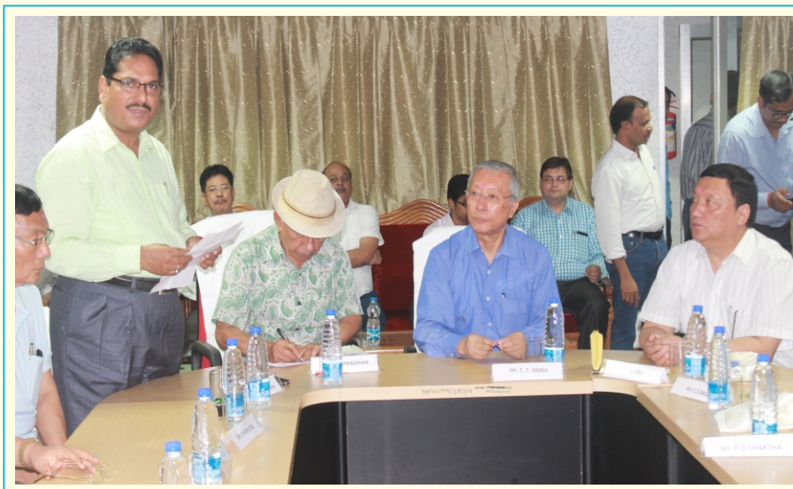
Chairperson(SSERC), Memebrs of SAC, Secretary and Officers of energy & Power Department being briefed by the Chief Engineer,510 MW Teesta-V HEP (Power House,Teesta V HEP)