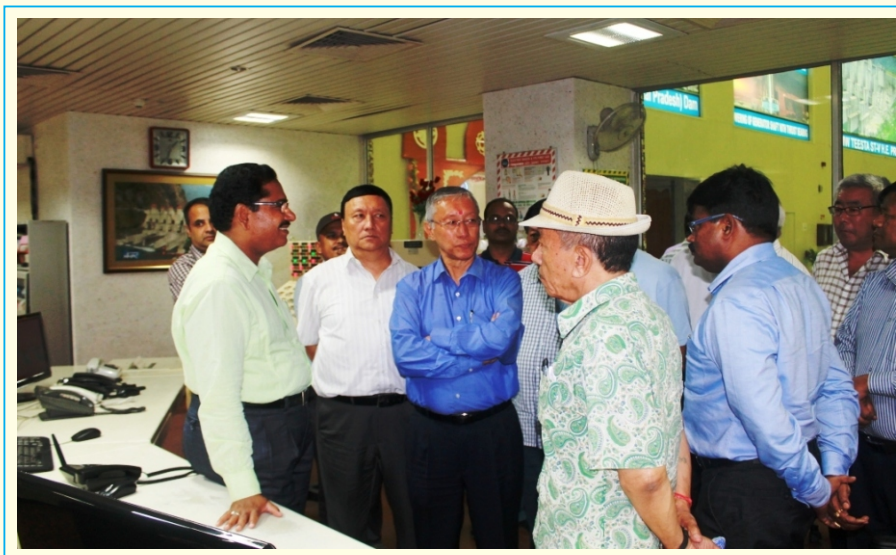
At Power House of 510 MW Teesta-V HEP