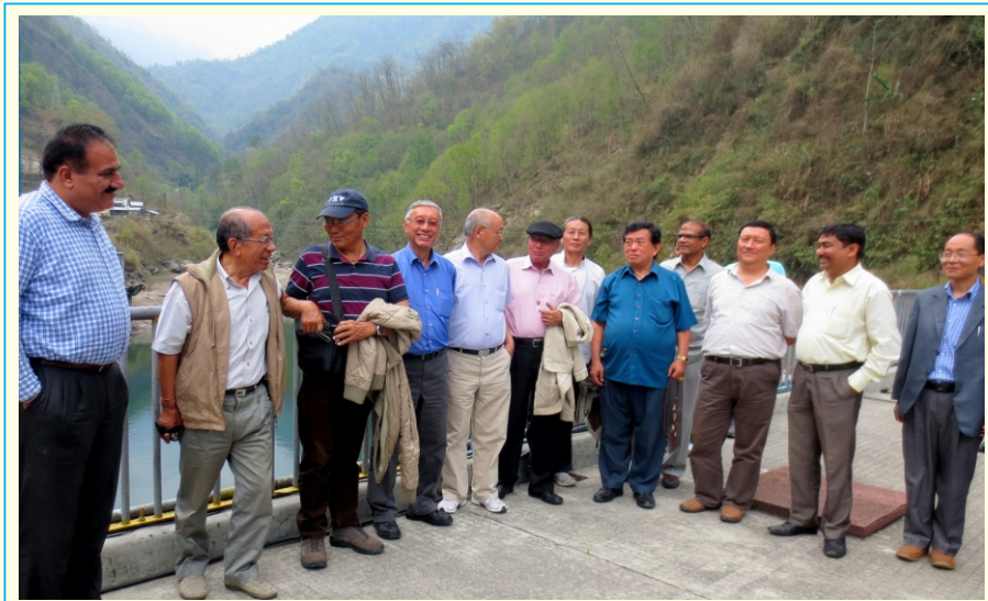
Chairperson (SSERC), Members of SAC, Secretary and Officers of Energy & Power Department And Official of 99 MW Chuzachen HEP at Rongli Dam