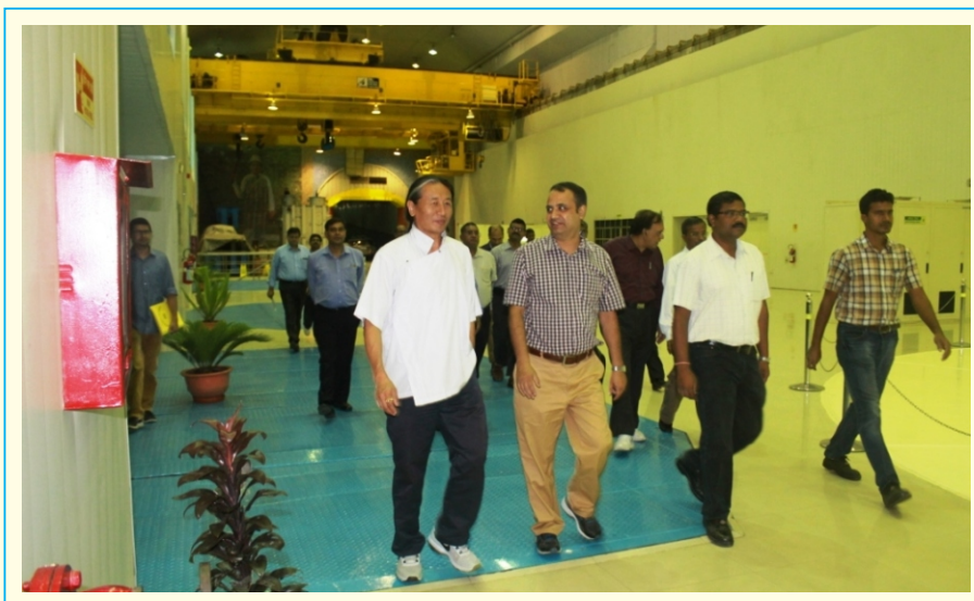
At Power House of 510 MW Teesta-V HEP