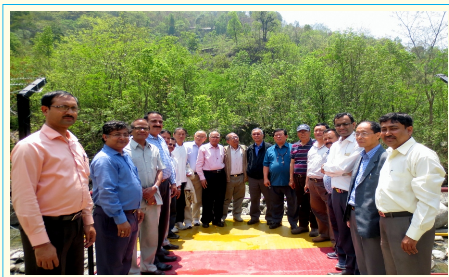
Visit of SAC to 99 MW Chuzachen HEP.