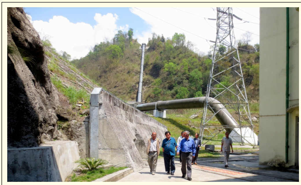
Visit to 99 MW Chuzachen Hydropower Project.