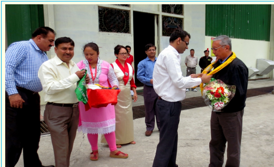
Chairperson being welcomed at the Powerhouse of 99 MW Chuzachen HEP.